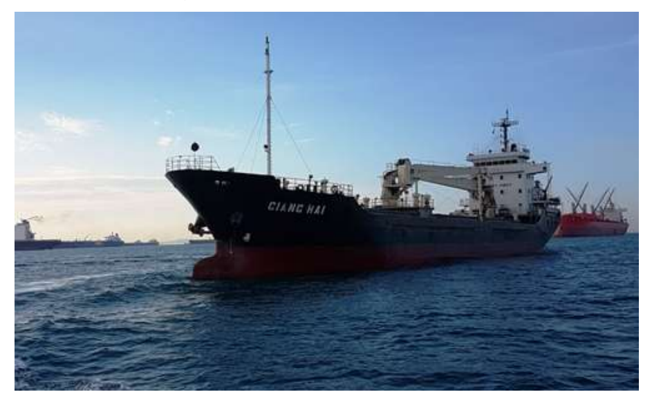
Figure 1: MV GIANG HAI

2. The Information Fusion Centre (IFC) acquired information that a Kidnap At Sea incident had occurred on board a laden Vietnam-Flagged Bulk Carrier "MV GIANG HAI", while the vessel was underway at Lat: 6° 7' 59"N, Long: 119°24'42"E, on 191824LT Feb 17. It has also been confirmed that the perpetrators abducted 6 crew members of Vietnamese nationality, and shot dead one crew member on-board the vessel. Reportedly, the remaining crew are safe and vessel is currently at TAGANAK Island (Turtle Island) to assist in investigations by the Philippine authorities. At the time of the incident, the vessel was reported to be fully laden with 4,500 tonnes of cement cargo.